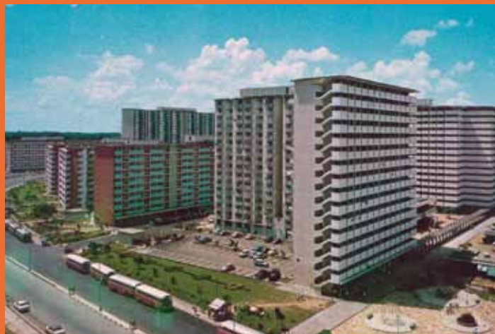
Coloured postcard showing Toa Payoh estate, 1960s

Singapore's first ten years of nation building was a time of hard work and achievement. Explore how the foundations of our nation were built: in defence, foreign policy, economy, education and housing. Visit our 1970s-inspired HDB living room, read magazines and watch newsreels from the time. Have fun at the void deck and relive moments of your childhood at the playground.