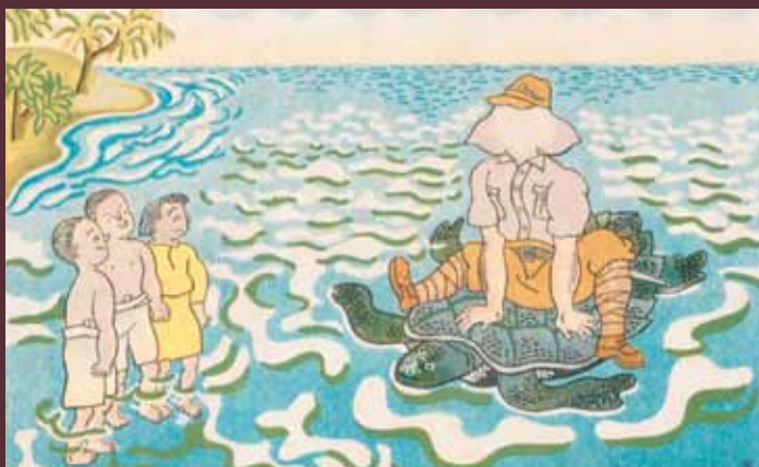
Japanese Occupation propaganda postcard, 1940s

On 15 February 1942, Singapore came under a new master: Japan. The city was renamed Syonan-To (the light of the south). Experience the lives of the people at the time: the fear of mass screening exercises, the lack of food and supplies and learning how to be Japanese in school. Walk into a Changi prison cell and see how Prisoners of Wars survived those years.