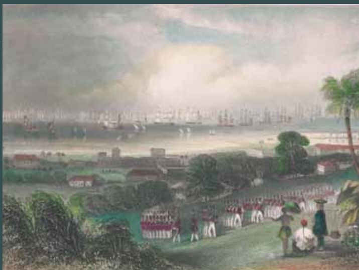
View of the East India Company garrison soldiers marching down Government Hill, 1830s

The arrival of the British in 1819 was central to the rise of Singapore as a regional trading hub. After setting up a factory on the island, they then secured rights to the island from the Malay rulers and developed Singapore into a thriving port and premier city in the region which attracted migrants from all over the world. Explore this section to see how the different communities lived and worked side by side.